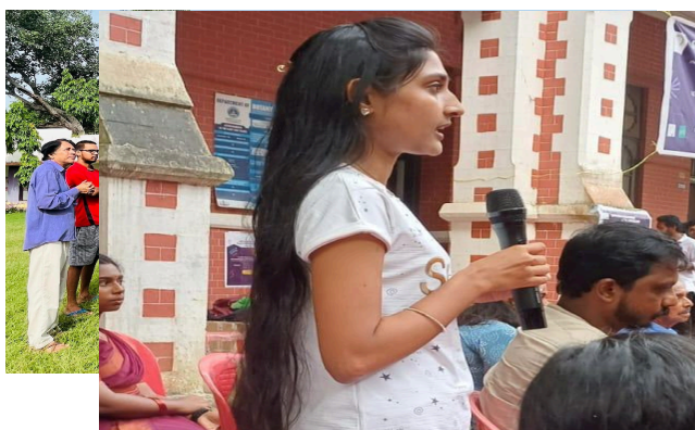
Inauguration of Football team at Jaura, Chambal Valley, Madhya Pradesh.

Donated 35+ educational kits for the children of Chambal village, Madhya Pradesh through this campaign