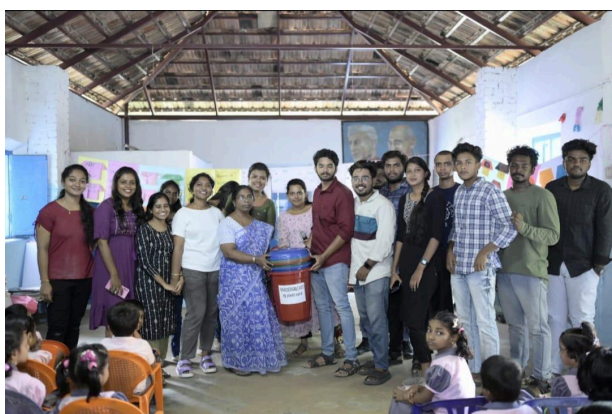
Students handing over the tubs to the principal of BFMLP & Pre pre-primary school in Avanankuzhi for Waste segregation after an awareness class conducted as part of waste management program in the school in Kottukal Panchayat