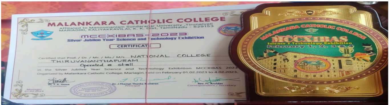
MSW students of department of social work arranged an exhibition stall projecting the importance of deaddiction and ill effects of drug use at Malankara catholic college.