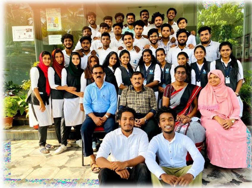
B.Sc. Computer Science (2019-2022)