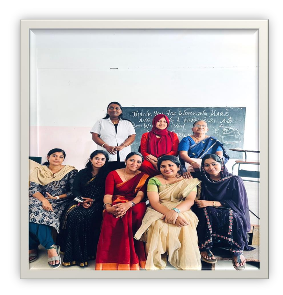
Farewell arranged by the department for the staff relieving from their service.